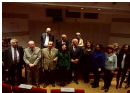
Figure 2. Speakers from the Scientific Communications Session of RSCSHP from October 14, 2022